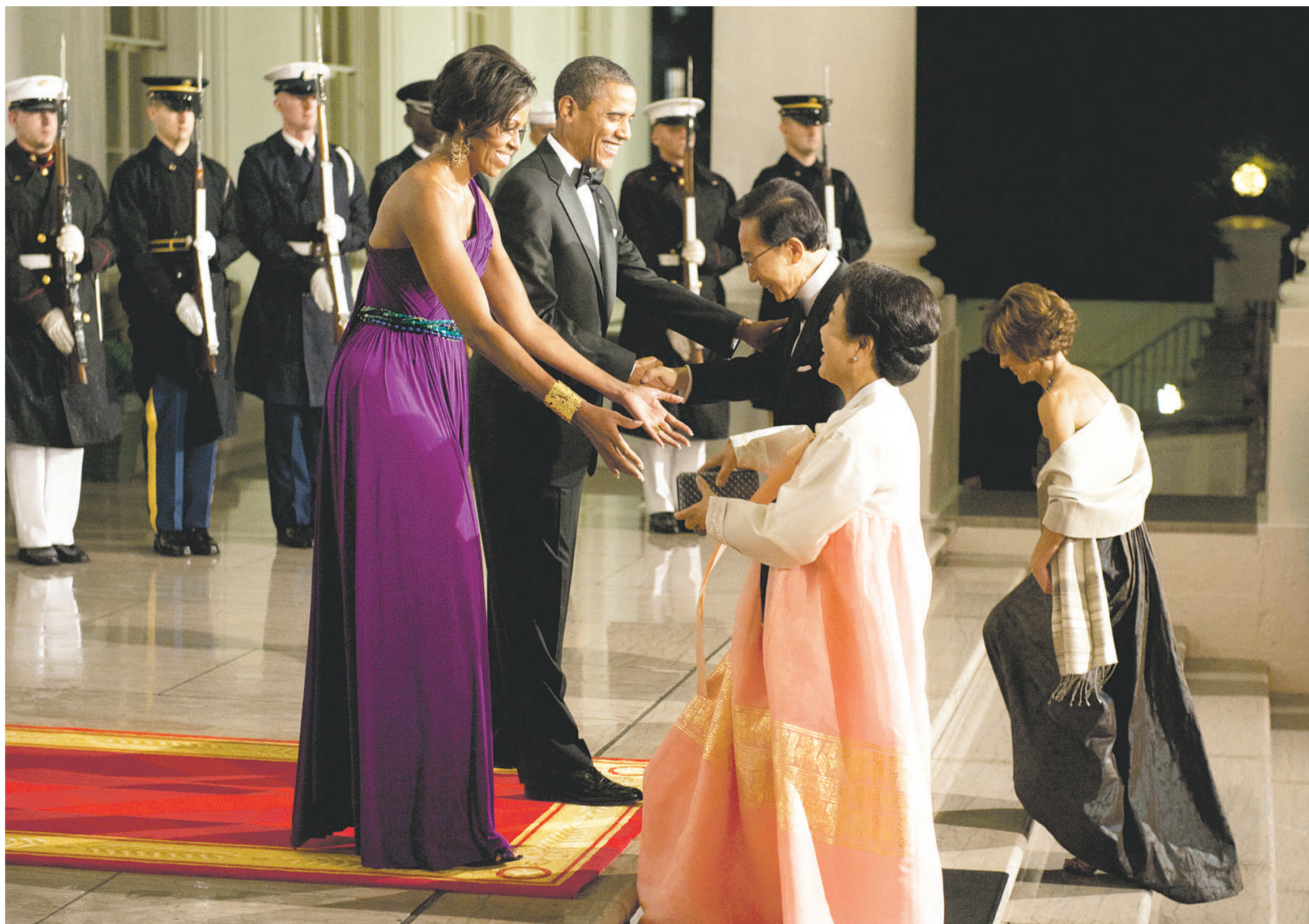
WELCOME PARTY: President Obama and first lady Michelle Obama greet South Korean President Lee Myung-bak and first lady Kim Yoon-ok at the North Portico of the White House.